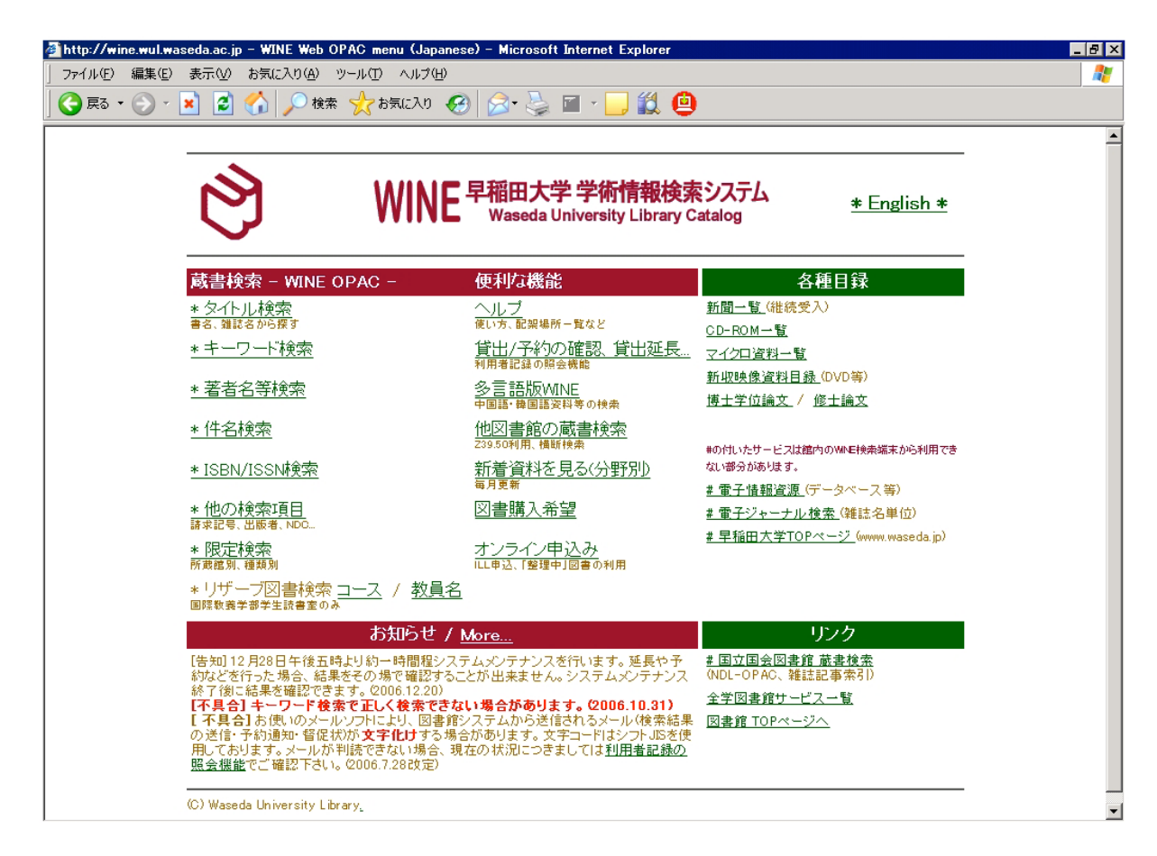
Figure 4.1: Waseda University Information Network System